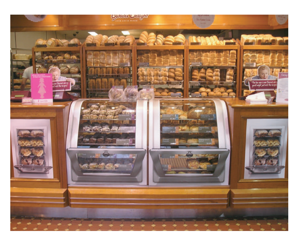
what a difference!